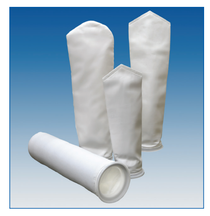
Figure 1: Pall's Bag Filters

After brewing and extraction, Pall's 1 micron polypropylene bag filters were employed as a particle removal step to eliminate remaining coffee grinds (see figure 1). With the broad size and