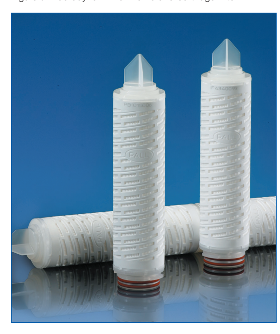
Figure 5: Fluorodyne II Final Membrane Cartridge Filter

Fluorodyne II filters are validated for sterility via bacterial challenge tests, demonstrating sterile effluent when challenged with at least 10<sup>7</sup> CFU Brevundimonas diminuta per cm² of effective filtration area.<sup>5</sup> For a copy of the technical report from the validation studies, please contact a Pall representative. Additionally, for validation of a specific low acid food process like cold brew coffee for removal of C. botulinum spores, manufacturers should contact a representative of the FDA.