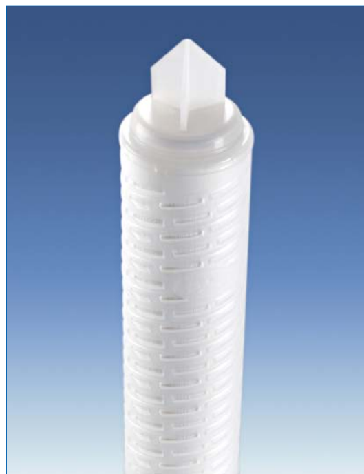
Emflon PFW filter cartridge

A significant consideration was filtration operating costs, especially as they related to cost per sterilization cycle. Due to the need for repeated in situ steam sterilization cycles, it was important for the customer to understand the degree of mechanical resistance and life expectancy of the filters as well as the nature of other filter performance claims.