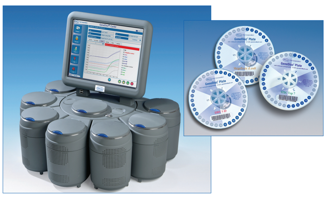
Filtration. Separation. Solution.sm

This initial sorting would prevent a late detection of contamination on final products that would lead to batch scrapping or recall.