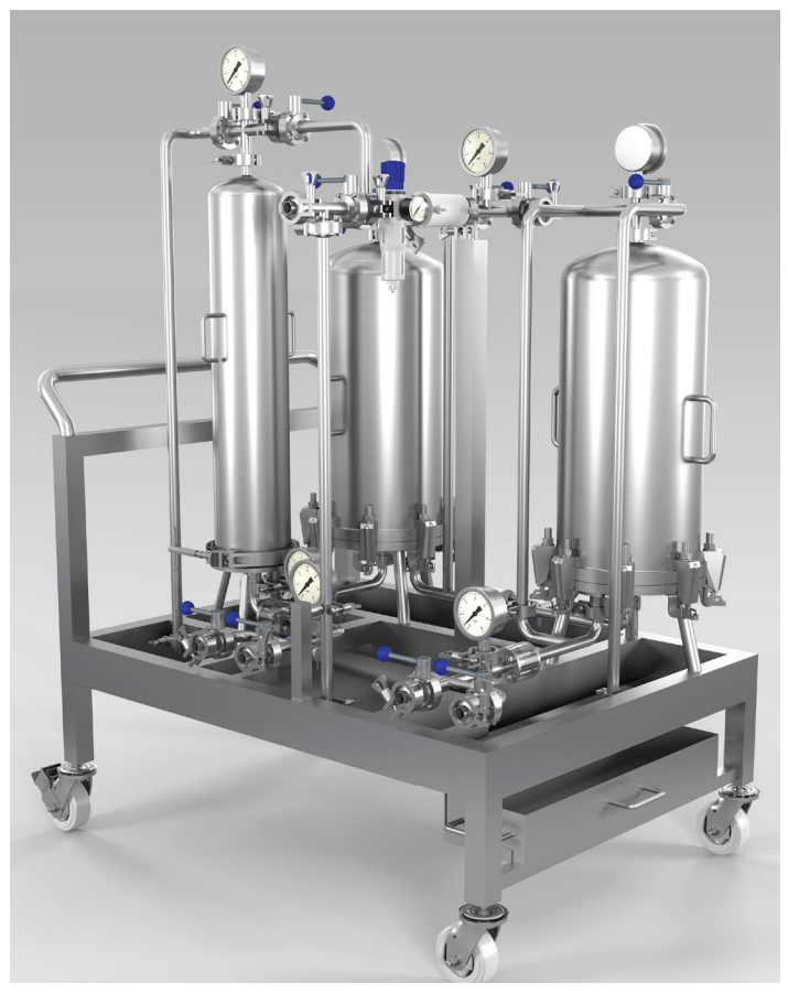
SUPRA Cannabis System E Series

The E series units are set up to include 3 stages of filtration. For clarification and wax removal, SUPRA Cannabis System E Series units hold 1 or 2 SUPRApak M modules, each representing up to approximately 2.7 m<sup>2</sup> (29.1 ft<sup>2</sup>) of filtration