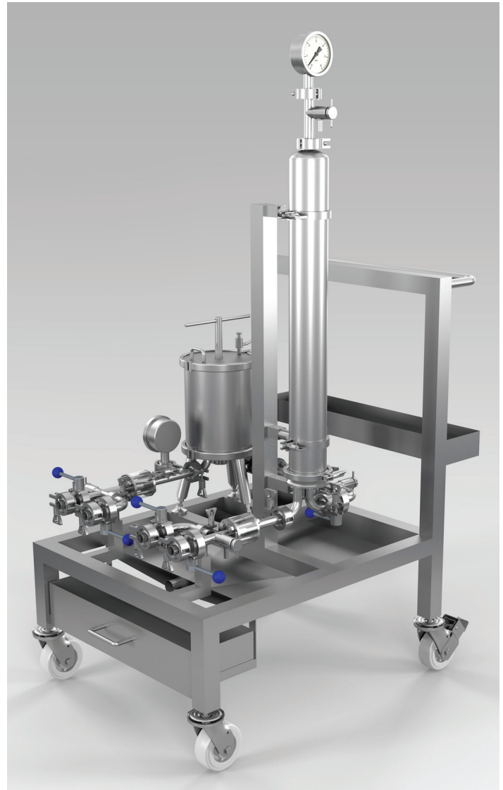
SUPRA Cannabis System S Series

SUPRA Cannabis System S Series units hold one SUPRAPak S modules, representing up to approximately 0.4 m 2 (4.3 ft 2 ) of filtration area in a very compact and low hold-up volume design.