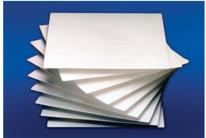
Seitz FA Series Filter Sheets

FA filter sheets are available in multiple grades suitable for polishing, clarification and microbial reduction.