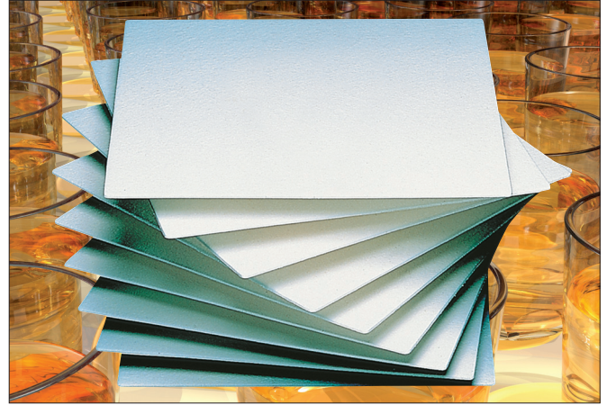
Seitz IR Series Filter Sheets