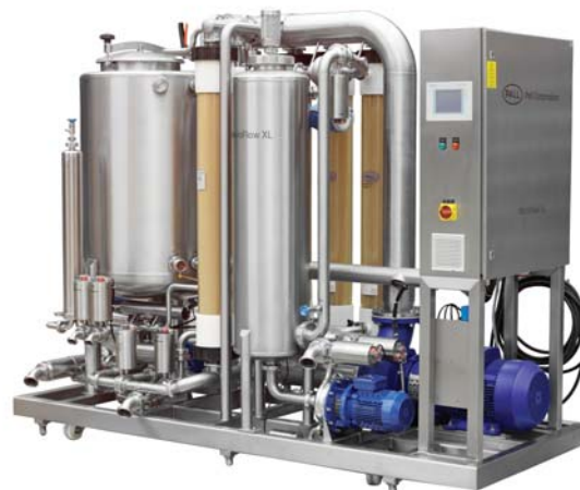
Pall Microflow XL Crossflow Microfiltration System