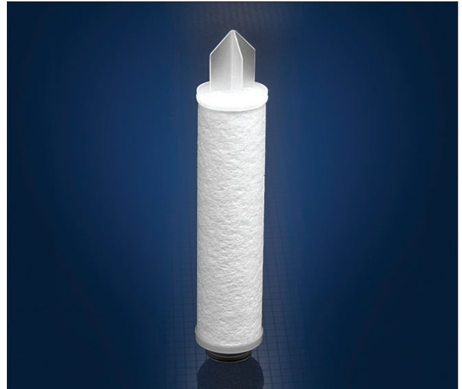
Nexis A Filter Cartridges