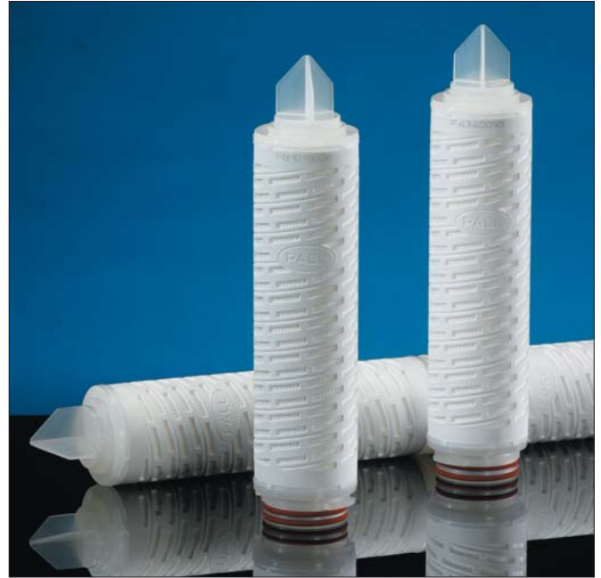
Oenoclear II Filter Cartridges