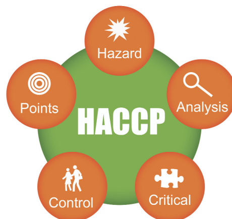
Figure 1: Hazard analysis and critical control points