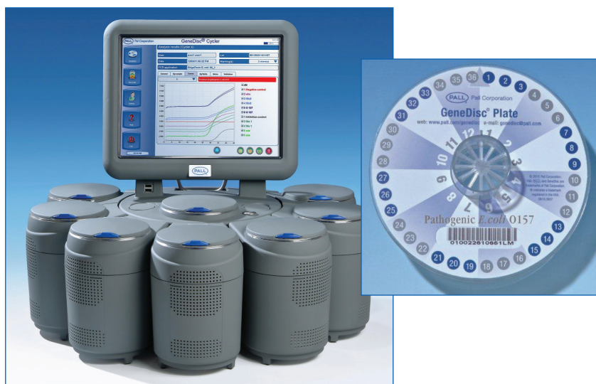
Figure 2: GeneDisc unit and a detection plate

Pall GeneDisc technology provides a complete range of options for a reliable control of O157 and non-O157 STEC risk. These options include an enhanced solution for the detection of STEC Top 7 which provides a lower rate of presumptive positive results than any other available method and minimizes risk of false positive results. This is achieved thanks to a unique method principle, based on the detection of virulence factors, that allows discrimination of pathogenic strains from non-pathogenic ones.