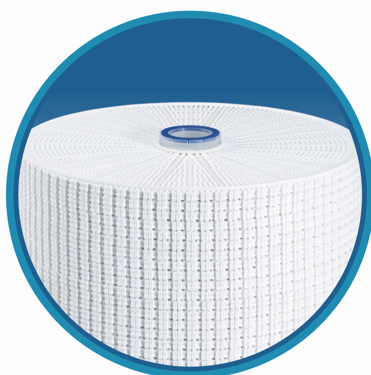
SUPRADisc™ II Modules