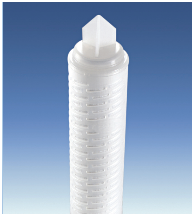
Emflon PFAW Filter Cartridges