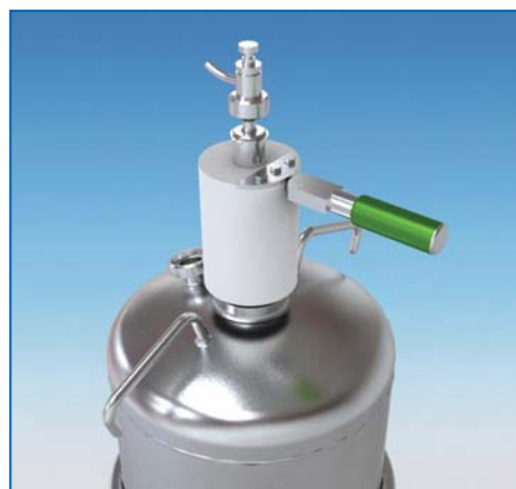
Figure 6: The torque unit is an external tensioning device with preset torque limit, which provides reliable and secure operation without bypass.

9 Adding new intermediate segments to the housing after original supply will require pressure rating reapproval by a local Notified Body.