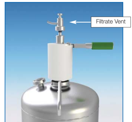
Figure 3: Optional filtrate vent