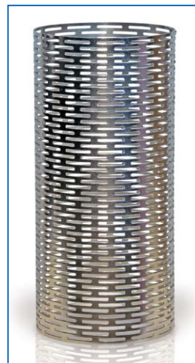
Figure 2: Stainless steel core for hot fluid filtration

8 For hot fluid filtration (>40 °C/ >104 °F) select Hot Fluid Core for the top module in the stack and add Hot Fluid Core Extension Z1 (1-high section) and/or Hot Fluid Core Extension Z2 (2-high section) as required. A 1-high housing will only require the Hot Fluid Core.