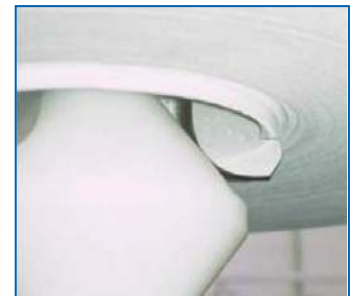
Figure 4: Hooks grab the bottom of the SUPRApak module stack for easy handling.