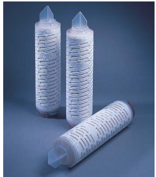
Figure 3 – Oenopure or MEMBRACart XL II 0.45 µm cartridges for water and juice filtration

Flat depth filter sheets are widely used in the apple juice process before final concentration steps, mainly for particle removal, turbidity stability, and Alicyclobacillus removal. Even if those filters provide an economical solution with an acceptable level of safety against Alicyclobacillus , the