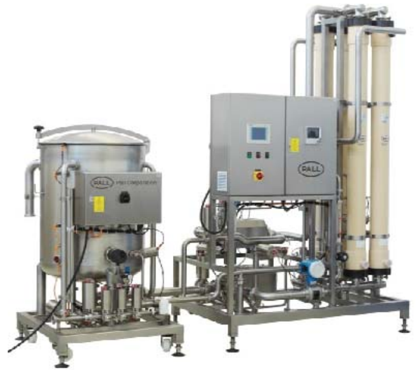
Figure 2 – Pall Aria FB systems for water filtration

The Pall Aria™ FB membrane filtration system (Figure 2) consists of robust testable hollow fiber modules installed on a stainless steel frame. The system runs in an automatic mode through a simple and easy-to-handle program. The system can be easily installed to treat difficult and critical water such as condensates water or water from