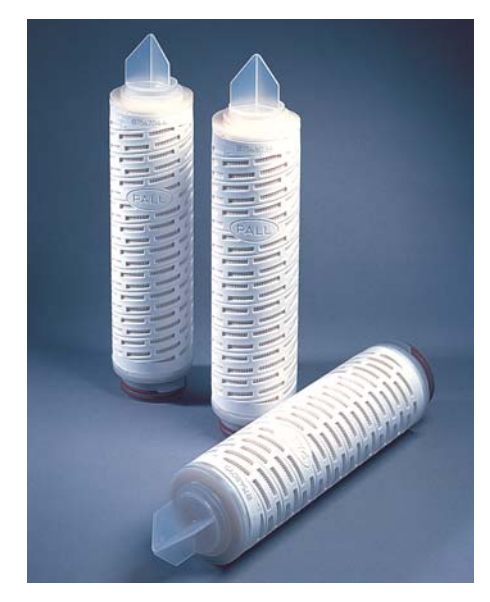
Figure 3: Cartridges for Alicyclobacillus removal

The study showed that cartridges solution, when suitable for juices (free of pulp or cells) and combined with appropriate disinfection procedures offer the highest level of safety against A. acidoterretris .