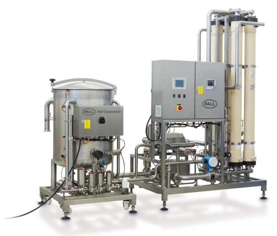
Figure 2: Pall Aria FB membrane system

The system in combination with a final membrane stage solution to ensure spores removal can be easily installed to treat difficult and critical water such as condensates ensuring effective water quality and preventing from spoilage by Alicyclobacillus spores.