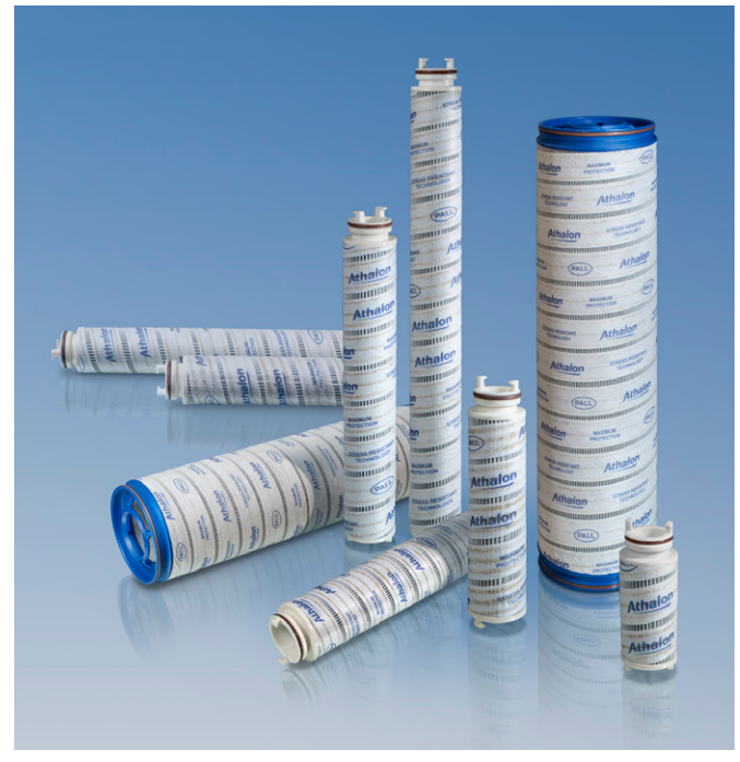
Athalon anti-static filter elements

Athalon™ Filter Elements The Next Generation in Anti-Static, Stress Resistant Filtration