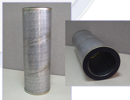
Pall F1390119 Filter Element