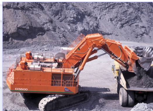
Mining Hydraulic Shovel