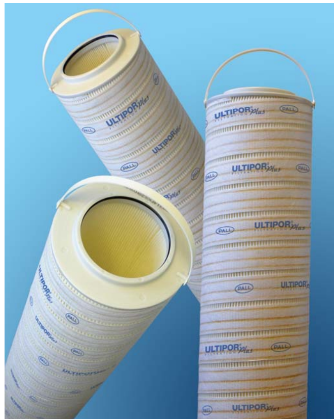
Ultipor® Plus filter elements