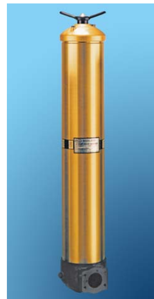
8304/8314 Series Coreless Ultipor® III filter housing