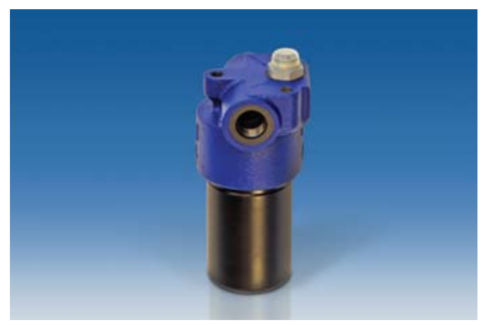
G210 Series filter housing