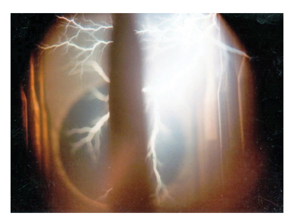
Electrical discharge occurring inside oil tank

If you stand beside a filter where arcing is occurring, you will hear a harsh knocking, crackling or pinging sound from within. This is the electric charge letting go against the side walls of the filter assembly. Internally, this can involve the filter, housing, reservoir and/or heat exchanger; externally, this can involve the surface/ pipe-to-ground or surface-to-surface. You may notice burn marks on the filtration medium and/or downstream