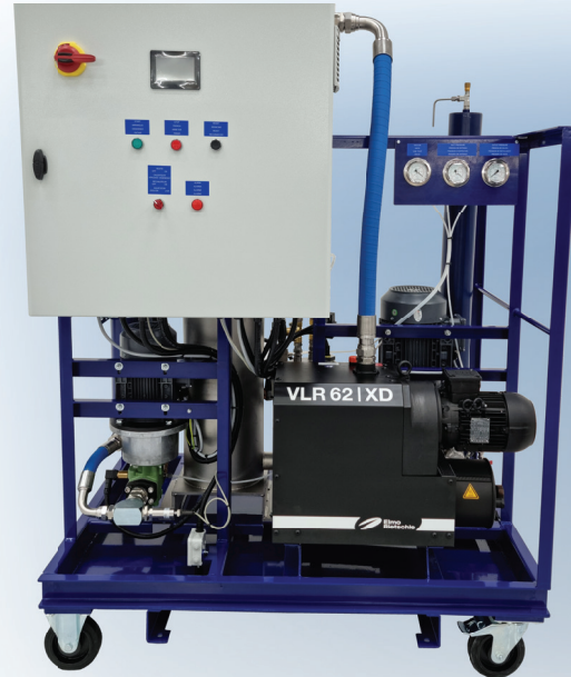
HDP10 Series Oil Purifier

Pall HDP Series Purifiers come with the following standard features that many suppliers charge extra for: