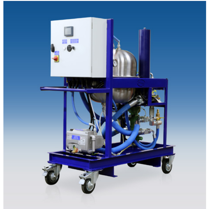
HNP023 Series Oil Purifier