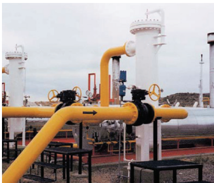
SepraSol liquid/gas coalescer system

High efficiency liquid/gas coalescers feature a full element fluoropolymer based surface treatment that enhances their liquid drainage capability. This results in minimum liquid left in the outlet gas. This surface treatment is proven to make a significant difference in the field, compared with conventional non-surface treated cartridge coalescers.