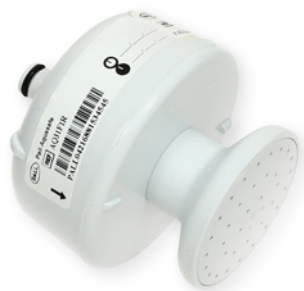
Water Filter: AQ31F1R