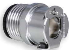
Quick Connect Adapter: TAP1/2MV