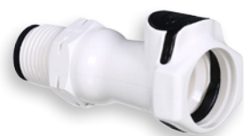
Quick Connect Adapter: SHO1/2MVN