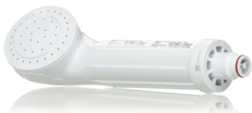
Water Filter: AQF4