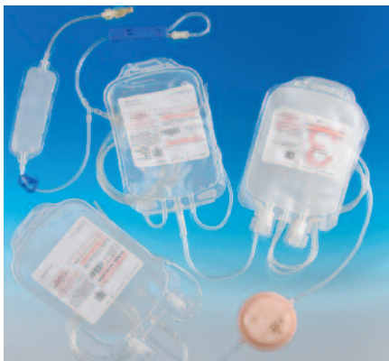
Reorder code: 129-92, Double with standard bags