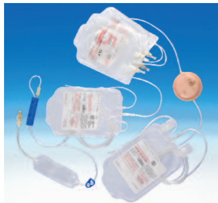
Reorder code: 129-93, Triple with CLX® platelet bags