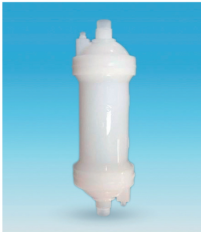
In-line G2 Kleen-Change