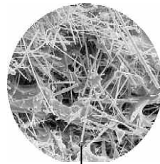
Scanning Electron Micrograph