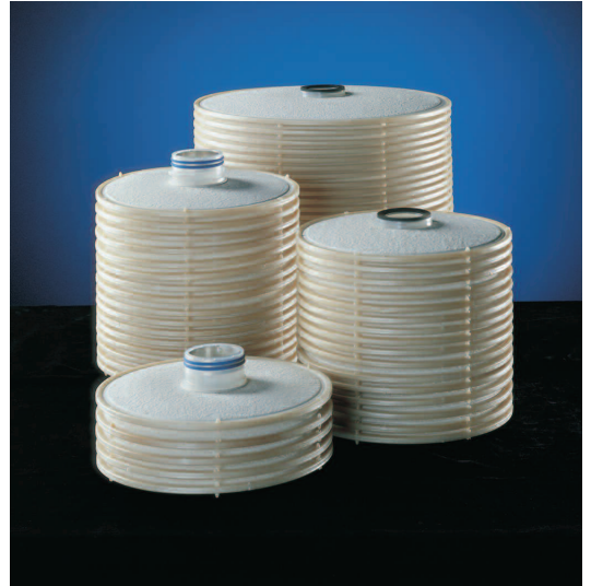
Figure 4: Pall's SUPRADisc depth-style modules

Pall offers a wide selection of media for use in its SUPRADisc depth filter modules. The T series of media was tested, and the T2100 media was subsequently recommended for use in this customer's application – the purifying of spent glycol. In general, grade T1000 media and higher is designed for coarse filtration. The media is characterized by an open structure and combines very high outputs with long filtration cycles due to the high dirt-holding capacity. The media is ideal for the retention of gel particles and coarse dispersed substances at low differential pressures.