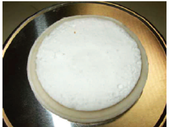
Figure 6: Filter cake shown collecting on the T2100 media