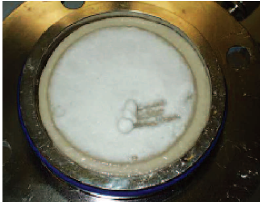
Figure 5: Filter cake shown collecting on the T1000 media