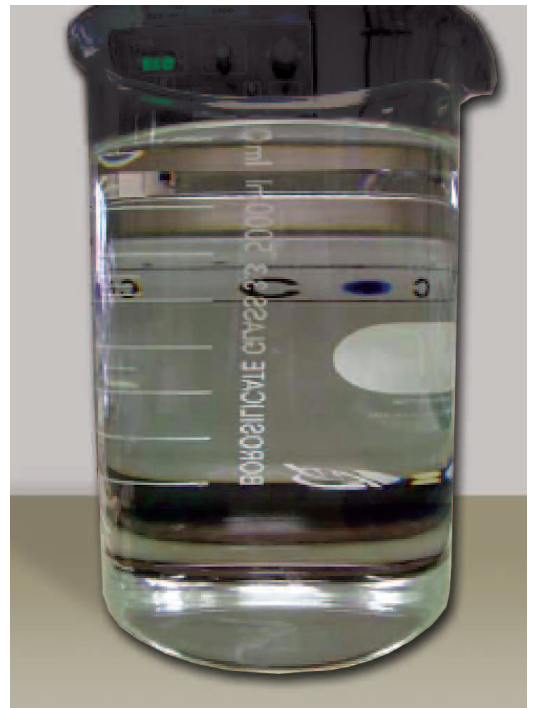
Figure 3: Filtrate with T2100 media