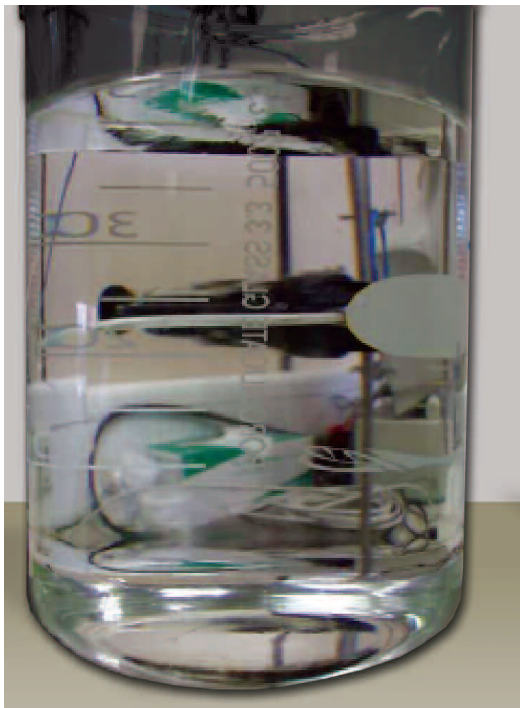
Figure 2: Filtrate with T1000 media