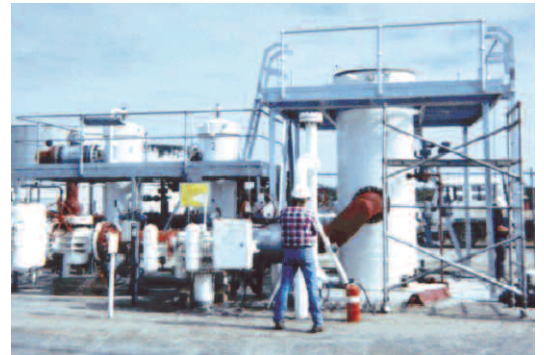
An Energy Company in the Southern Hemisphere Power Station Gas Turbine Protection Pall SeptraSol™ L/G Coalescer - 80 x CC3LGA7H13