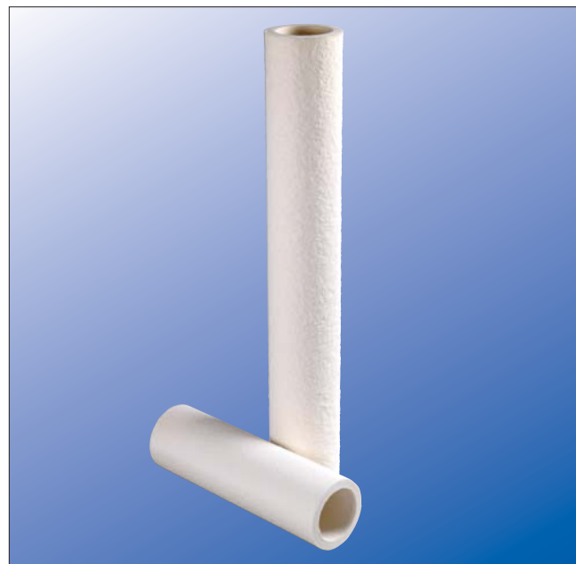
Profile Coreless Filter Element

The Profile Coreless filter element is manufactured to a very high standard of quality assurance and cleanliness, and in accordance with BS EN ISO 9001:2008.