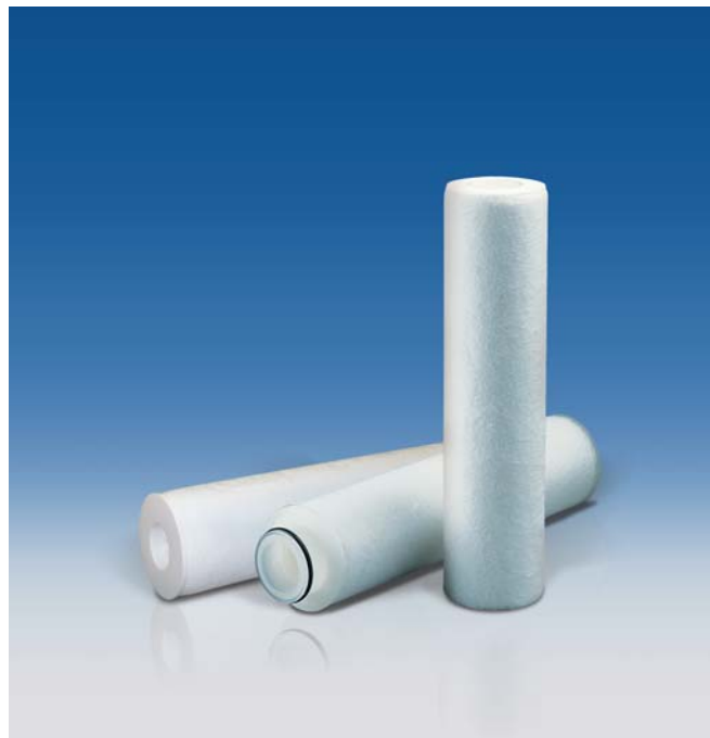
Profile M and N Filter Cartridges

Profile M and N filter cartridges are manufactured to a very high standard of quality assurance and cleanliness and in accordance with BS EN ISO 9001:2008. It is the ideal disposable filter option for metallic/mica paints.