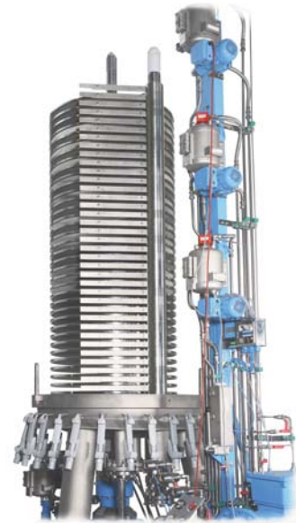
With opened vessel