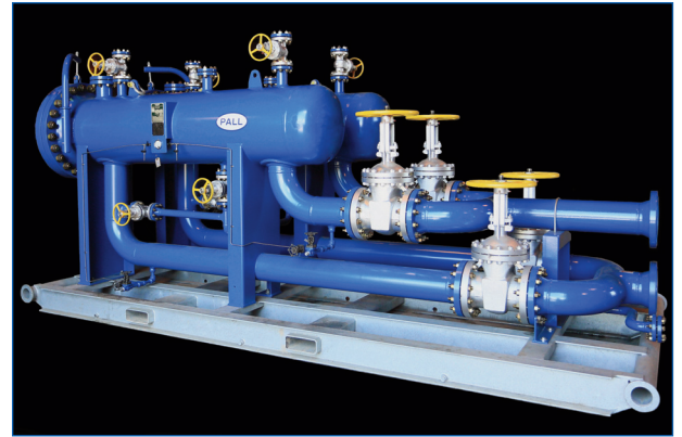
7-Around Duplex High Flow filter rental skid (side view) 1