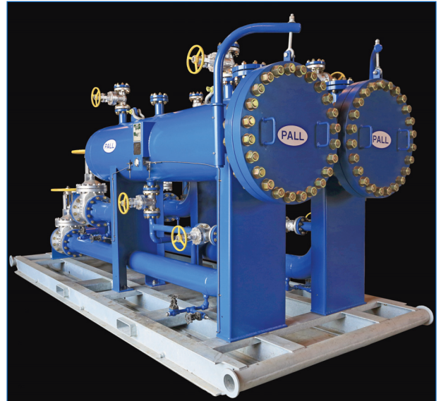
7-Around Duplex High Flow filter rental skid (closure view) 1

3 Grafoil is a registered trademark of Graftech International