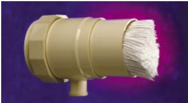
View of Hollow Fiber Membrane Module Cut-away.