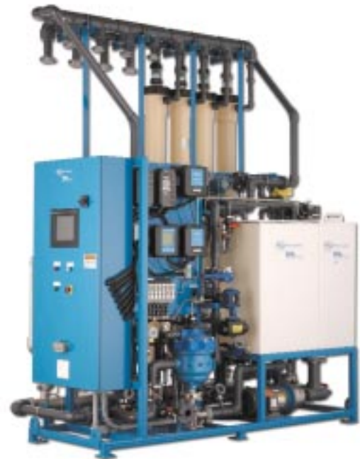
Pall Aria Water Treatment System with control panel and modules.