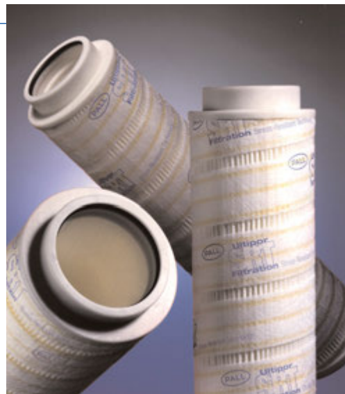
Ultipor SRT Filter Elements