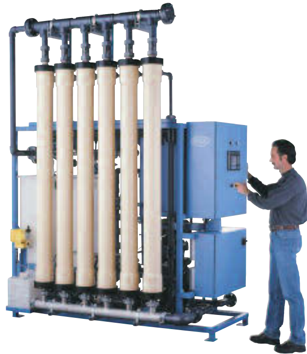
Pall's Aria Membrane Water Treatment System.

Treatment begins with microfiltration. An Aria™ MF unit from Pall Corp, East Hills, NY, eliminates all solid contaminants above 0.1 micron in size. MF effluent is essentially free of solids, colloidal silica, and bacteria. It is piped to a temporary storage tank with sufficient volume to permit operation of the RO unit and polishing demineralizers at peak efficiency while the Pall filter undergoes periodic self-cleaning. Next step is chemical treatment for softening and to prevent scaling, and flow through a granulated activated carbon filter to remove residual chlorine. The resultant filtrate, with an average total dissolved solids (TDS) of 650 ppm, is piped to the suction inlet of Puretec's E-frame, dual-pass RO skid. It reduces the mineral and salt load in the influent by 99%, yielding a product effluent with 1.5 ppm TDS. Permeate is piped to a 120,000-gal tank for storage and degasification. On demand, the RO permeate is pumped from the storage tank through a set of mixed-bed polishing demineralizers to remove any remaining ionic material. CCJ