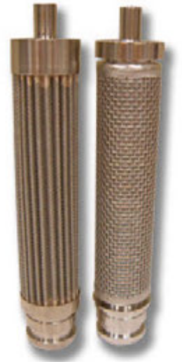
Control Rod Drive filters using Pall's Rigimesh media are used throughout the BWR fleet.

Pall's disposable nuclear cartridges are designed with exceptional structural integrity and perform well in environments with high radioactivity and varied pH. They have long service life, which means less radwaste, fewer changeouts, and added protection for equipment and personnel.