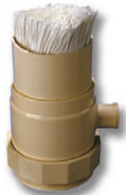
Pall module cut-away reveals hollow fiber membrane

Successfully removing the undesirable constituents from wastewater streams is critical for conformance with stringent environmental regulations. Pall offers advanced wastewater management systems that are fully integrated, reliable, flexible, and easy to use. They are designed to optimize each step in the wastewater treatment process. Our Pall Aria microfiltration and ultrafiltration systems, backwash systems, and reverse osmosis systems successfully treat wastewater to meet your requirements, even when they are zero liquid discharge.