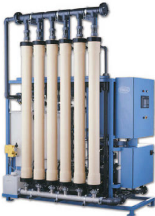
Pall Aria water treatment system is compact and flexible and produces high quality treated water

These advanced features can improve your reverse osmosis (RO) operation, reduce your chemical costs for precipitation, coagulation, and RO membrane regeneration, and lower your water treatment costs.