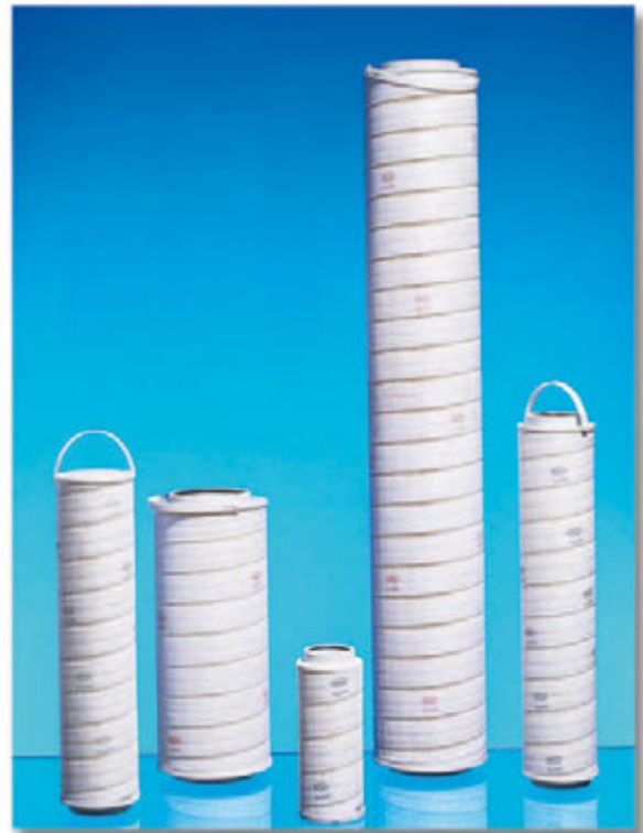
Pall's Ultipor III cuts down on wear in turbines, reducing bearing wipes and improving start-up success.