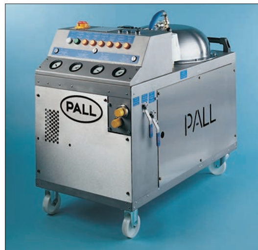
Pall HNP021 fluid purifier