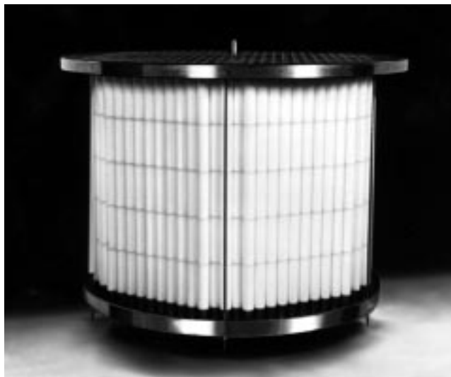
HGPPB also offered in tubesheet and cage designs.

This information is with water at ambient temperatures. Differential pressures are in PSID based on flow in GPM through a 10" (25.4 cm) element.