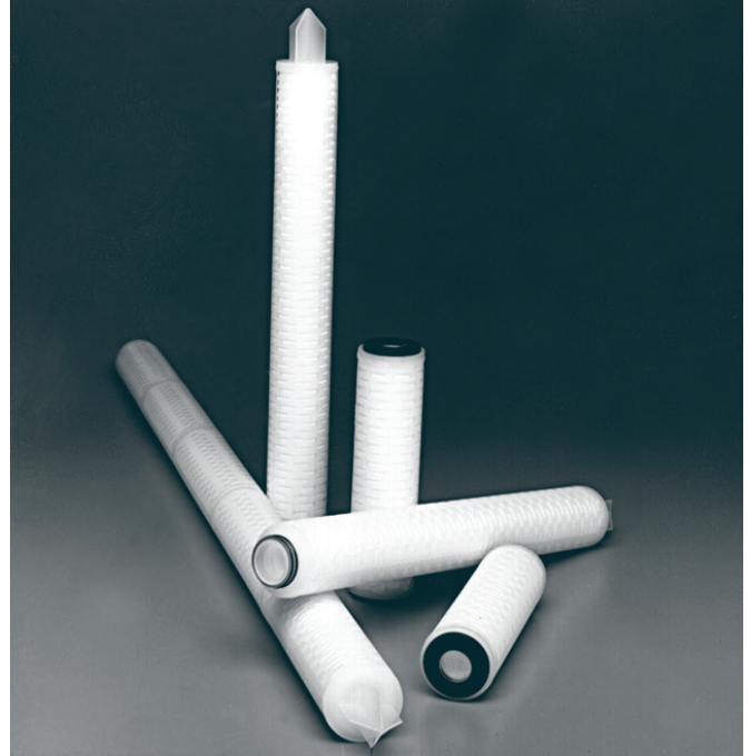
HYDRO-Guard PPB-R Series Cartridges.