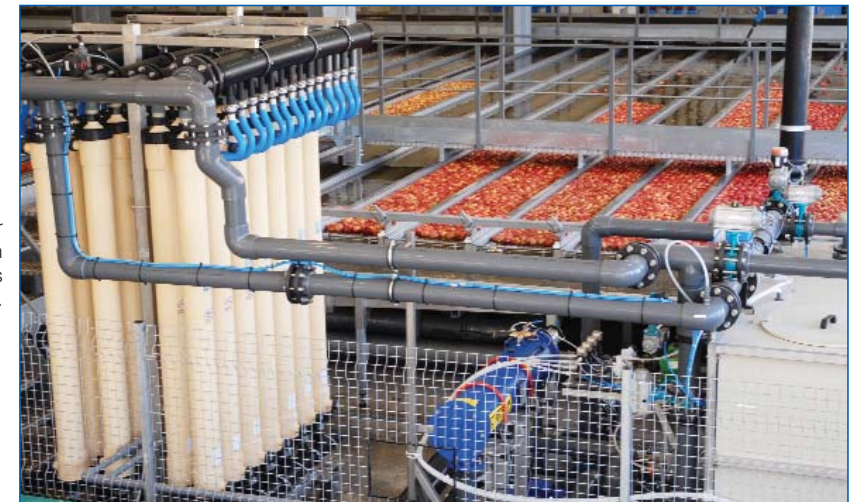
A Pall Aria system for process water recycling in table fruit production results in 80% water savings.