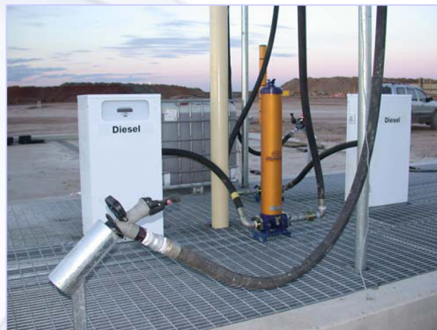
Pall Ultipleat ® SRT In diesel fuel applications