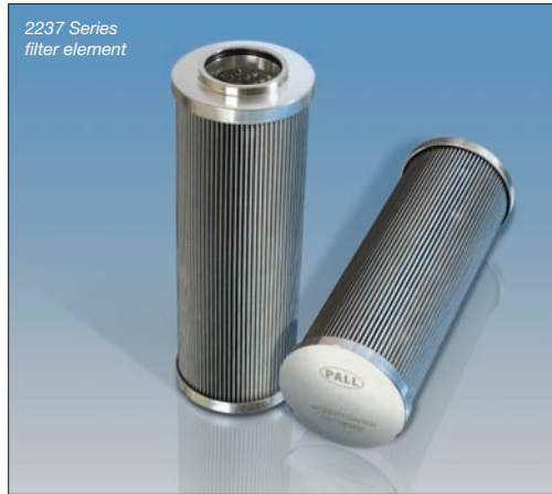
Table 4: High collapse pressure filter elements for use in non-bypass filter applications. 210 bard (3045 psid) collapse rated.

Check for interchangeability in the listing below: