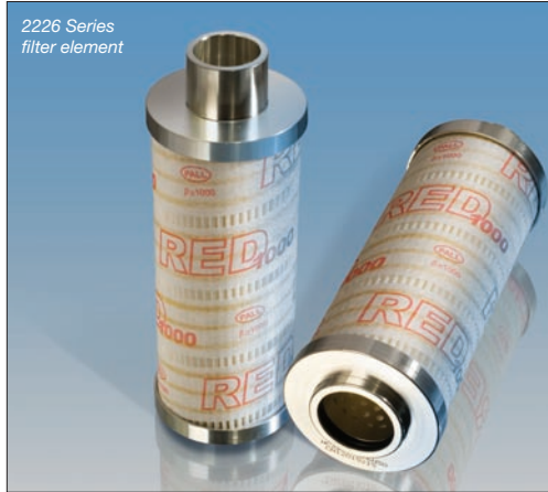
Table 2: Return-line filter elements with integral 3.4 bard (50 psid) bypass valve. 10 bard (145 psid) collapse rated.

Check for interchangeability in the listing below: