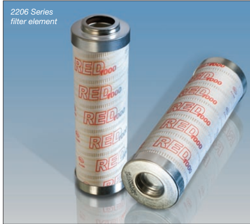
Table 3: Pressure-line filter elements for Hydac standard collapse pressure elements (bypass valve in housing). 10 bard (145 psid) collapse rated.

Check for interchangeability in the listing below: