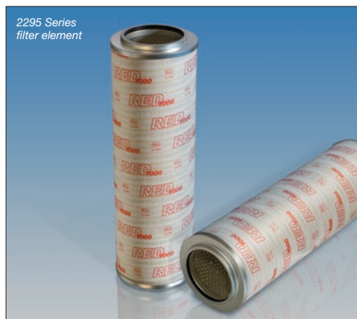
Table 1: Return-line filter elements for use with re-usable bypass valve (3.4 or 5.6 barg (50 or 82 psid) setting). Re-usable bypass valve must be ordered separately. 10 barg (145 psid) collapse rated. For equivalent filter with integral, disposable bypass, see table 2.

Check for interchangeability in the listing below: